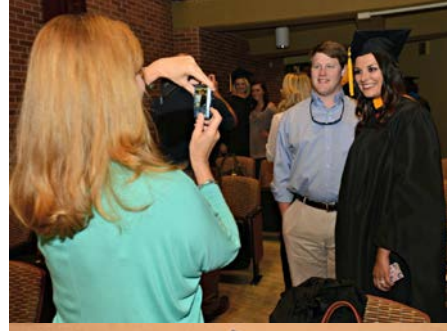
A student poses for a photo following the College of Health Professions Hooding Ceremony.

University of Arkansas for Medical Sciences College of Health Professions 4301 West Markham, #619 • Little Rock, Arkansas 72205 Telephone: (501) 686-5730 • Fax: (501) 686-6855 http://healthprofessions.uams.edu/